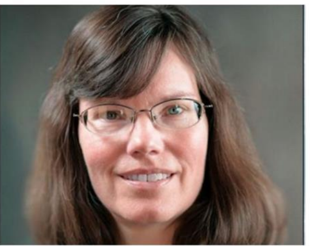
A VIRTUAL ROUND-TABLE DISCUSSION WITH PUBLIC HEALTH EXPERTS