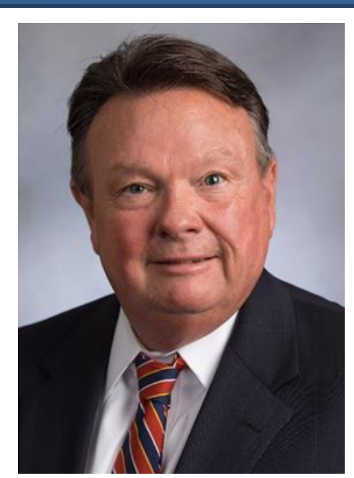
FROM YOUR REPRESENTATIVE on the DEMOCRATIC NATIONAL COMMITTEE