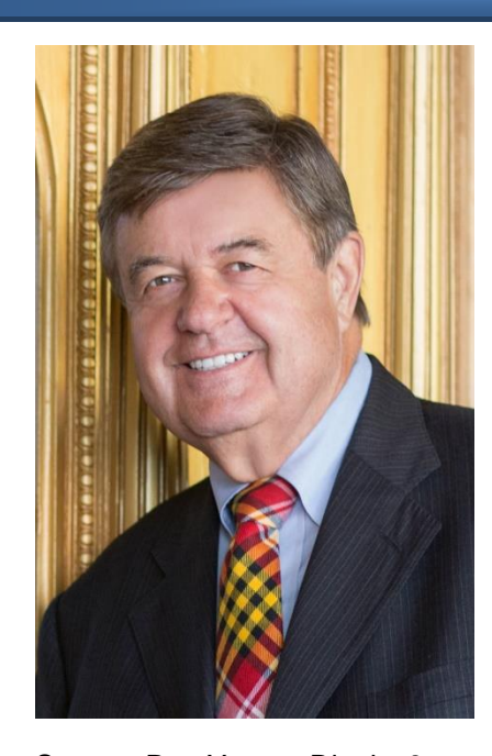
Senator Ron Young- District 3

The Maryland General Assembly begin the 2021 legislative session last month. This has been a session like no other due to the ongoing COVID-19 pandemic. Committee hearings are being conducted virtually. Committees and the full Senate are limiting inperson voting sessions in order to reduce the risk of spreading the COVID-19 virus and ensure we still fulfill our constitutional duties.