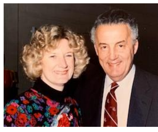
Sen. Sarbanes and Gail Bowerman