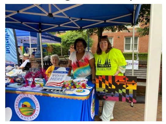
Frederick Dems @ Frederick Pride, 06.24.23