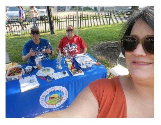
Frederick Dems Happy Hour, 06.14.23