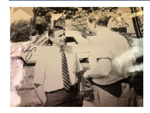
Democratic congressional candidate Goodloe E. Byron campaigning at Staley Park in Frederick in 1970 with Senator Joseph D. Tydings