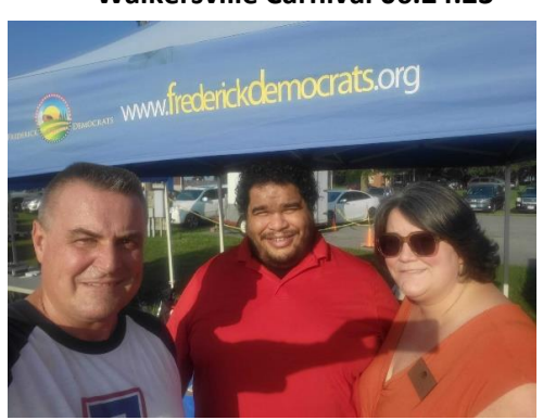
Walkersville Carnival 06.24.23