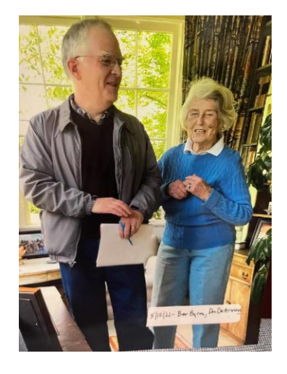
A recent picture of Don DeArmon with former 6<sup>th</sup> District congresswoman Beverly B. Byron