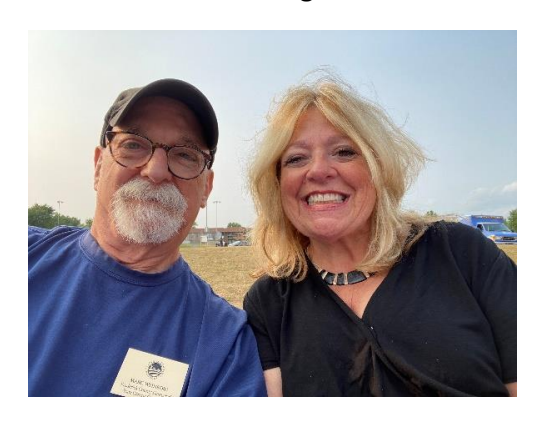
National Night Out