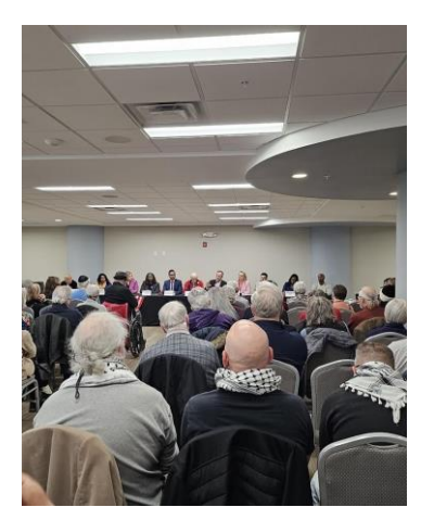
Democratic Forum for CD6 Candidates